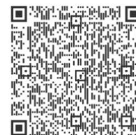
Deseret Book Journal Edition